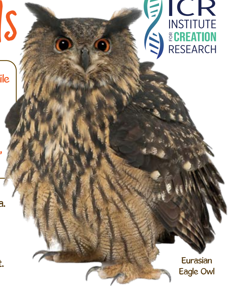
Eurasian Eagle Owl