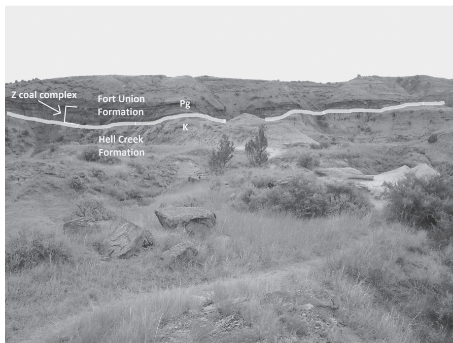
Figure 2. Photograph of the boundary between the Hell Creek Formation and the overlying Fort Union Formation near Glendive, Montana, showing the “Z coal complex” at the base of the Fort Union (Tullock Member).

The contact between the Fort Union and the Hell Creek formations is believed to be nearly isochronous over more than 500 km, in contrast to the base of the formation (Johnson et al., 2002). According to Johnson et al. (2002), this implies a rapid transgression of the Paleocene seaway across the Hell Creek Formation, which deposited the Cannonball Member of the Fort Union Formation. This likely marks the onset of the Tejas Megasequence across western North America.