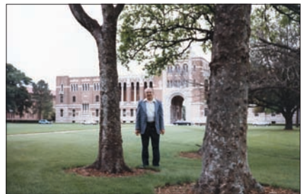
A visit to Rice University, 1982.

His scholastic excellence allowed him to obtain a full scholarship to Rice Institute, otherwise there would have been no college training. The science department at Rice University, was at that time dominated by the famous