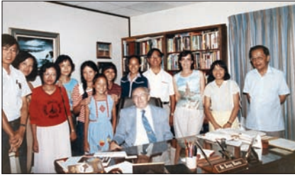
Chinese Tour Group, 1982.

even metaphysical speculation. To the engineer, however, the science has to work . His designs must be tested. One cannot just theorize about the size of a beam or the stresses of an engine.