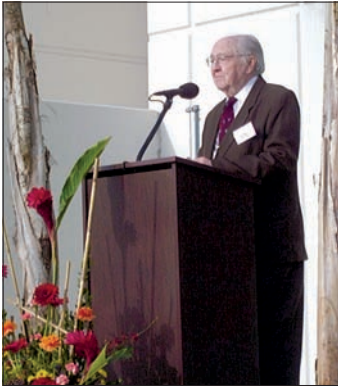
Dedication of ICR's educational building, 2000.

Several items had been pasted into the flyleaf of his Bible he used for many years, which had energized and motivated him. One of them was a quote from Martin Luther. He too had stood almost alone against an establishment in opposition to Scripture. His mindset of “Sola Scriptura” energized both of them in their work. This quote was used often in lectures and in his writings.