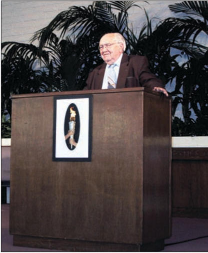
Passing The Torch Conference, 2002, Calvary Chapel, Costa Mesa, CA.

to explore and develop and enjoy the endless marvels of His infinite creation.