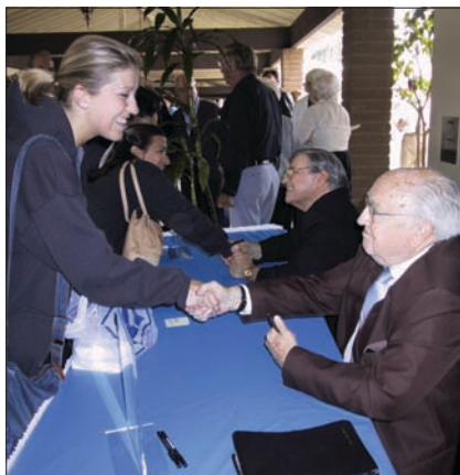
Passing The Torch Conference, 2002.

But then we are also each to obey the Missionary Mandate as well. If Christians are indeed to “preach the gospel to every creature” (Mark 16:15), then it is