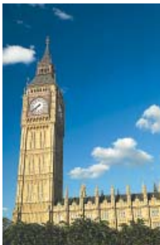
Big Ben in London, England.

Attendance in churches all over England has remained extremely low since the late 1800s when Darwin's theory of evolution began to take effect. In England today, less than three percent of the population claims to attend church of any belief. An encouraging bit of revival has crept into England in recent years, and interestingly, it is paralleled by the emergence of several creation organizations.