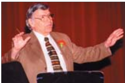
Creation's Bulldog in his element.