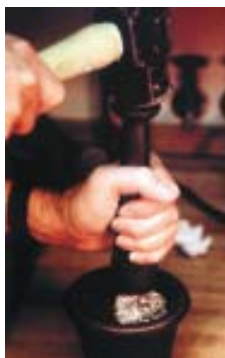
Preparation of granite sample.

These results have the potential for earth-shaking changes in geochronology. The group was enthusiastic about the results being found and encouraged that the