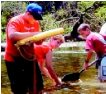
Children at camp.

Exciting and educational “creation adventures” are now available for residents and visitors to fabulous southern Florida. Hands-on workshops, fossil digs, fossil-hunting canoe trips, and overnight camps are offered to church, school, and home school groups by the “ Creation Adventures Museum ,” which also conducts three-day and week-long family camps and church retreats plus courses for college and CEU credits, especially during the spring break season. Longer adventures include trips to the beach and Everglades and snorkeling/diving in the Florida Keys! All programs explore the wonders of God’s world in the light of God’s Word.