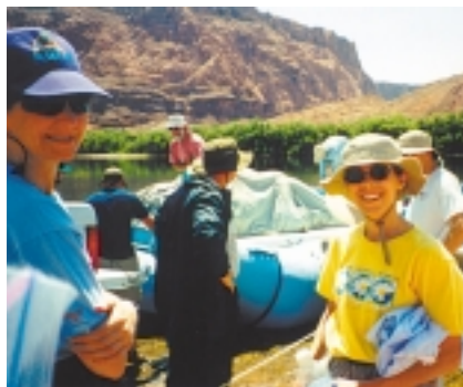
The research trip launch at Lee's Ferry.